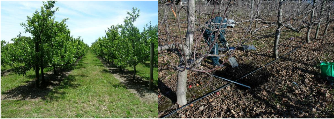
Figure 1a. Left. Havelock North integrated apple orchard. Figure 1b. Right. Mixing charcoal into the soil

We compared the microbial biomass according to the method of Höper (2006). Microbial respiration was determined by using basal respiration (Öhlinger et al. 1996), Dehydrogenase activity (Chandler and Brooks 1991) and microbial biodiversity of the soil with and without charcoal as biological soil properties.